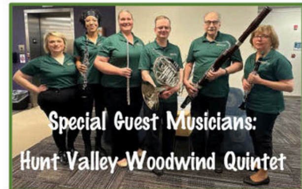
Special Guest Musicians: Hunt Valley Woodwind Quintet