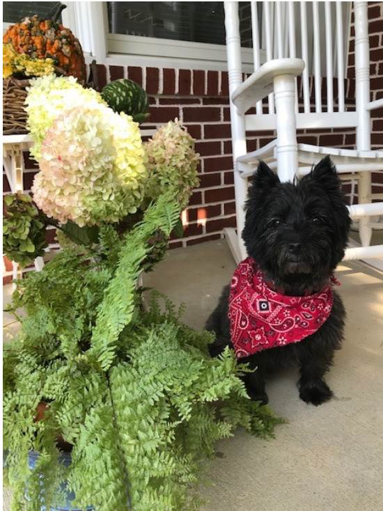
PoGo Swift ... how precious is this little boy !!