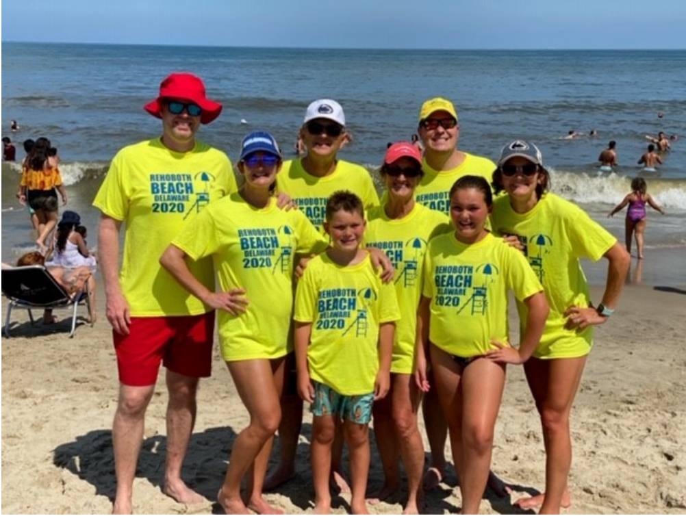
COVID-19 can't stop The Thomas Family from having a fun time at Rehoboth Beach !