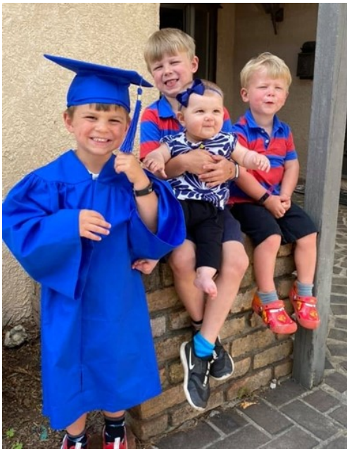
The Swinscoe Family ... celebrating summer in a fun way at the beach! Congratulation to all on the latest Graduate of 2020 ☺